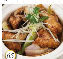
65 頭抽哈利拔 Sautéed Halibut in Supreme Soy Sauce 20.98