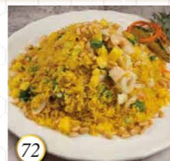
72 鮮菠蘿海鮮炒飯 Assort Seafood & Pineapple Fried Rice 36.98