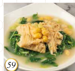
59 銀杏腐皮浸豆苗 Poached Pea Tips & Beancurd Sheet in Broth 22.98