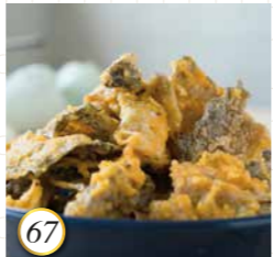
67 金沙脆魚皮 Fried Crispy Fish Skin w/ Salty Egg Yolk 18.98