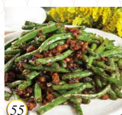
55 乾煸四季豆 Stir Fried String Bean w/ Minced Pork 19.98