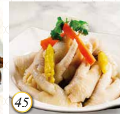
45 泡椒鳳爪 Crystal Chicken Feet w/ Chili 19.98