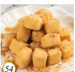
54 金沙滑豆腐 Deep Fried Golden Tofu with Garlic 18.98