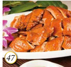
47 金牌豉油三黃雞(半隻) Soy Free Range Chicken (Half) 35.98