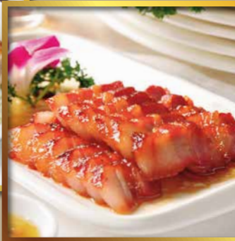
自製蜜汁叉燒 26.98 House Special BBQ Pork