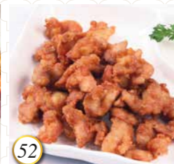
52 椒鹽雞膝 Deep Fried Chicken Joints w/ Spicy Salt 20.98