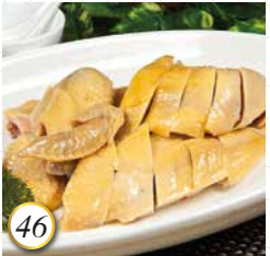
46 馳名貴妃三黃雞(半隻) Marinated Free Range Chicken (Half) 35.98