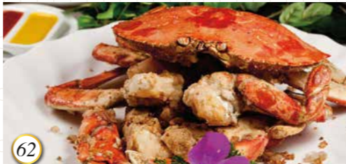
62 鴻星招牌胡椒蟹 Stir Fried BC Crab with Pepper 時價 Current Price