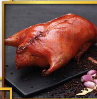
69.98 全隻 Whole