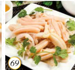
69 白灼金菇桂花蚌 Poached Sea Cucumber Muscles w/ Enoki Mushroom 45.98