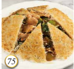
75 味菜涼瓜豬頭骨煎米粉 Pan Fried Vermicelli w/ Pork Jowl & Bitter Melon 38.98