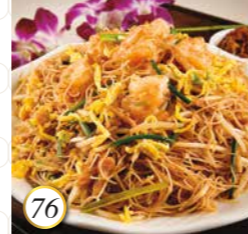
76 家鄉炒米粉 Stir Fried Vermicelli w/ Shrimp & Preserved Meat 35.98