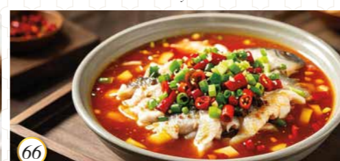
66 水煮鱸魚片 Poached Sliced Sea Bass in Sichuan Chili Soup 59.98