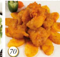
70 金沙年糕蝦球 Sautéed Prawns & Rice Cake in Salted Egg Yolk 25.98