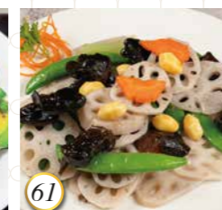
61 荷塘月色 Sautéed Lotus Slices, Snow Bean & Black Fungus 18.98