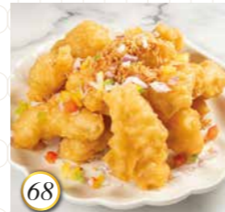
68 椒鹽炸鮮魷 Deep Fried Squid with Salt & Pepper 20.98