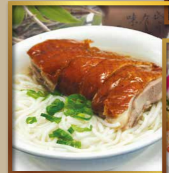
招牌燒鴨瀨粉 25.98 BBQ Duck with Rice Spaghetti in Soup