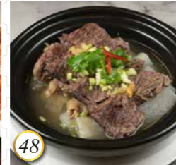
48 清湯蘿蔔牛肋皇 Beef Short Ribs & Daikon Radish in Broth 36.98