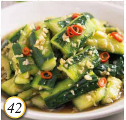
42 陳醋手拍青瓜 Marinated Cucumber with Garlic & Vinegar 18.98