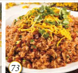
73 特色臘味糯米飯 Fried Sticky Rice with Preserved Meat & Sausage 36.98