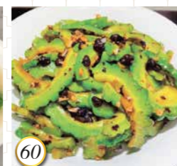
60 蒜頭豆豉炒涼瓜 Stir Fried Bitter Melon w/ Garlic & Black Bean Sauce 21.98