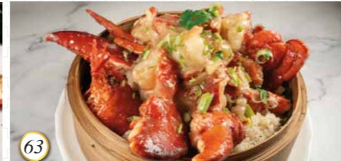
63 荷香珍珠龍蝦飯 Stir Fried Lobster on Sticky Rice 時價 Current Price