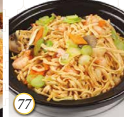
77 海鮮煲仔伊麵 Braised E-Fu Noodle with Assorted Seafood 35.98