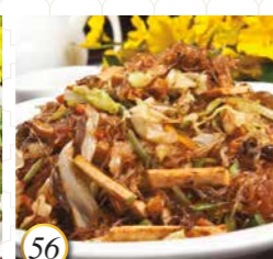
56 乾炒羅漢上素齋 House Special Buddha's Feast 19.98