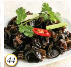
44 香醋涼拌雲耳 Marinated Black Fungus 17.98