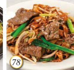
78 翡翠乾炒牛河 Pan Fried Rice Noodle w/ Beef & Veggie 35.98