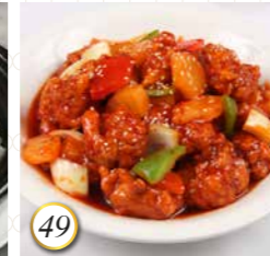
49 新鮮菠蘿咕嚕肉 Sweet and Sour Pork w/ Fresh Pineapple 25.98