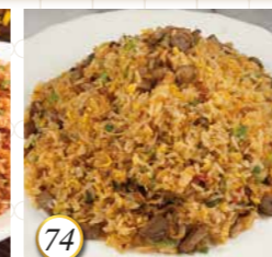
74 頭抽鴨粒脆米炒飯 Diced Duck Meat Fried Rice 32.98