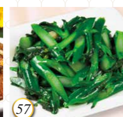
57 薑汁生炒芥蘭片 Sautéed Chinese Broccoli w/ Ginger Sauce 21.98