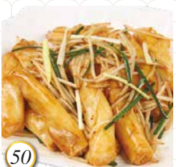
50 豉油皇煎腸粉 Pan Fried Rice Rolls w/ Supreme Soy Sauce 18.98