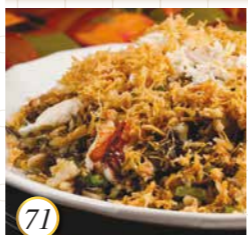
71 鴻星養生野米炒飯 Red Star Nutrition Fried Wild Rice 49.98