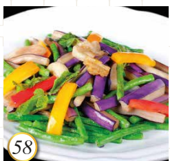
58 蒜香茄豆合炒 Stir Fried Eggplant & String Bean w/ Garlic 18.98