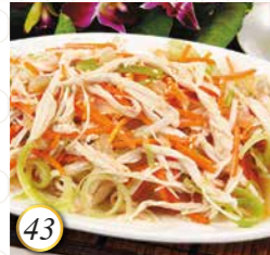
43 撈起手撕雞 Shredded Chicken & Jelly Fish Salad 26.98