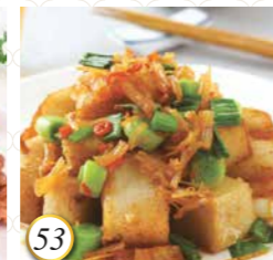
53 XO醬炒蘿蔔糕 Stir Fried Radish Cake with Spicy X.O. Sauce 20.98